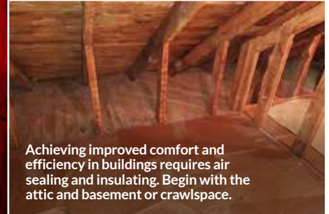
Achieving improved comfort and efficiency in buildings requires air sealing and insulating. Begin with the attic and basement or crawlspace.