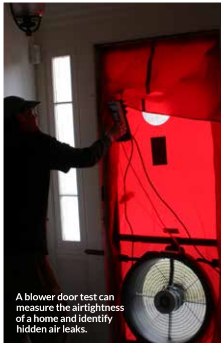
A blower door test can measure the airtightness of a home and identify hidden air leaks.

Also examine cantilevers, which are floor sections that extend beyond the foundation.