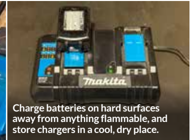
Charge batteries on hard surfaces away from anything flammable, and store chargers in a cool, dry place.