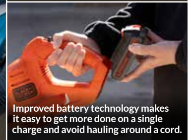
Improved battery technology makes it easy to get more done on a single charge and avoid hauling around a cord.

maintenance, charging and disposal. Always use the manufacturer's original charging equipment, charge batteries on hard surfaces away from anything flammable, and store chargers in a cool, dry place.