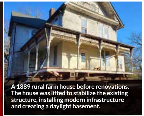
A 1889 rural farm house before renovations. The house was lifted to stabilize the existing structure, installing modern infrastructure and creating a daylight basement.