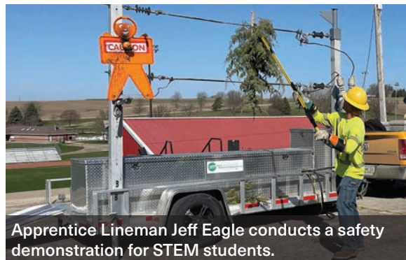
Apprentice Lineman Jeff Eagle conducts a safety demonstration for STEM students.