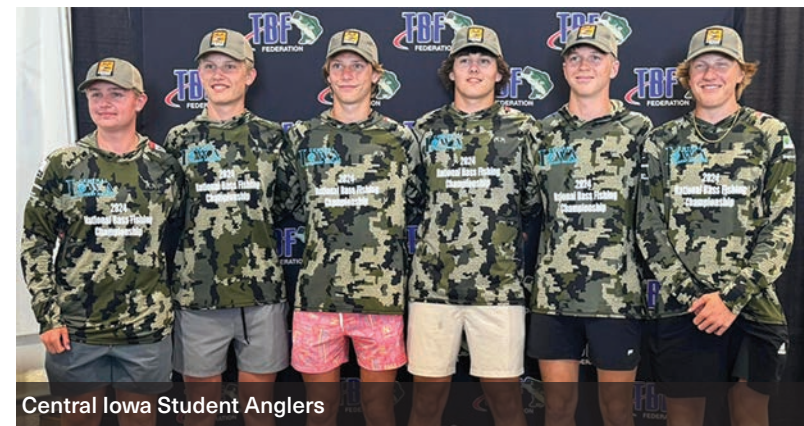
Central Iowa Student Anglers