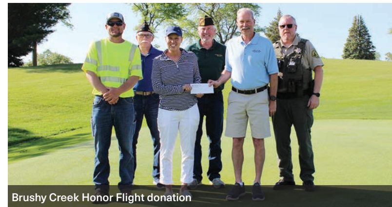
Brushy Creek Honor Flight donation