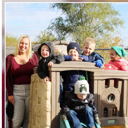
◀ Guthrie Co. REC granted a $150,000 revolving loan fund to Little Panthers Daycare in Panora for an expansion project.